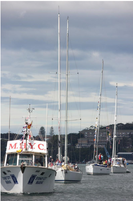
Scenes from the Opening Sailpast