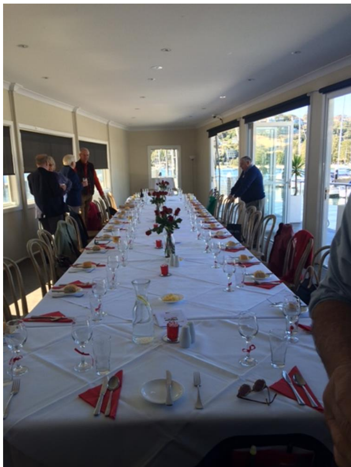
The Long Lunch August 21st