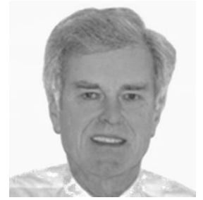
PHOTO CORNER COMPETITION 2016