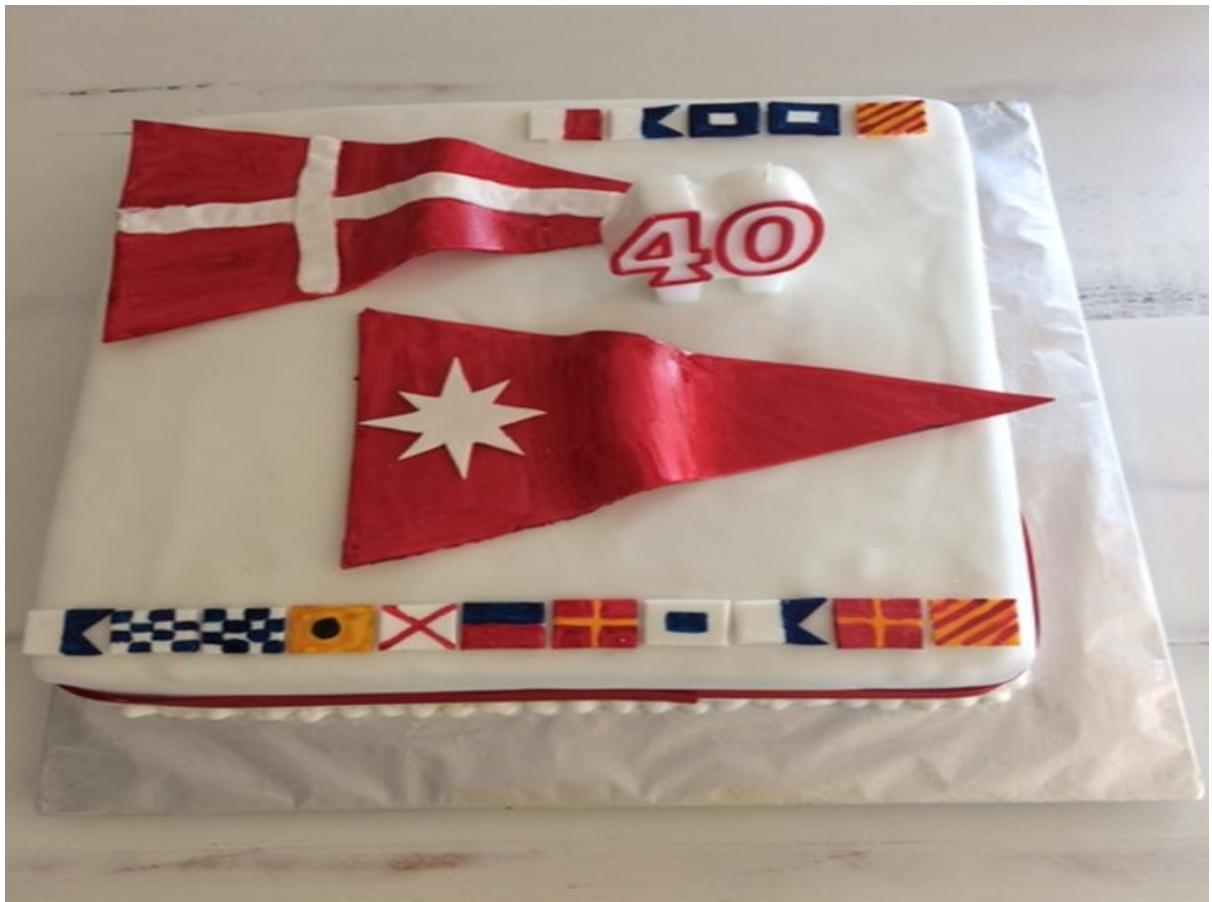
The Birthday Cake 40 years of the Cruising Division